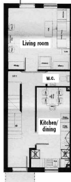
Ground Floor Layout